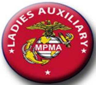
MPMA Ladies Auxiliary Official Seal/Logo

Dark Blue Suit – Your Choice Plain White Collared Blouse – Your Choice Plain White Gloves – Your Choice MPMA Uniform Hat - $50.00 (Special Order Form) Dark Shoes – Your Choice